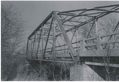
West Branch White Water River Truss Bridge. Benton Vicinity, Kansas. Westside of bridge. 02/17/1981.