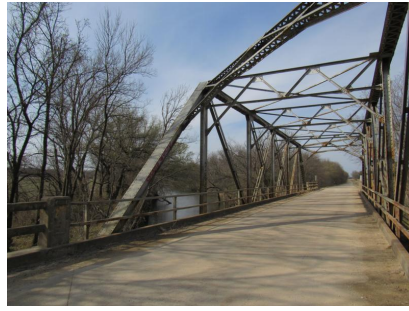
Facing west. 3/13/2017. Wendi M. Bevitt