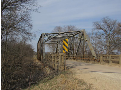
Facing east. 3/13/2017. Wendi M. Bevitt