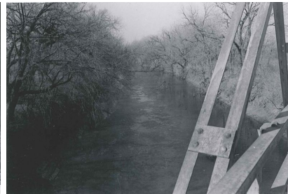
West Branch White Water River Truss Bridge. Benton Vicinity, Kansas. View of stream to the west. 02/17/1981.