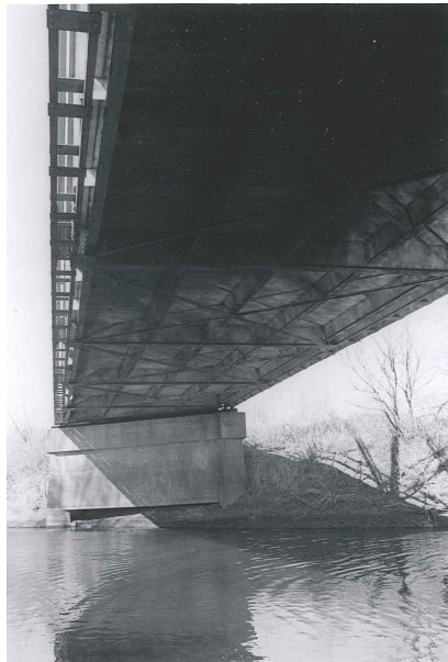
West Branch White Water River Truss Bridge. Benton Vicinity, Kansas. View of bridge underside. 02/17/1981.