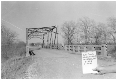
West Branch White Water River Truss Bridge. Benton Vicinity, Kansas. Thru Bridge North. 02/17/1981.