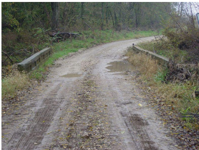
E. BR. Whitewater River Concrete Bridge. NW 130TH St. 10/20/2005. KDOT/Newton, Dale.