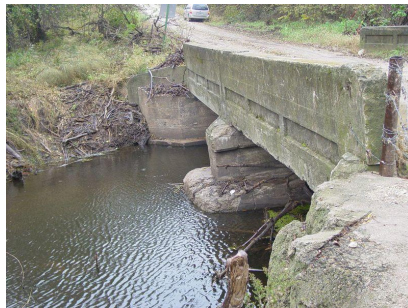
E. BR. Whitewater River Concrete Bridge. NW 130TH St. 10/20/2005.