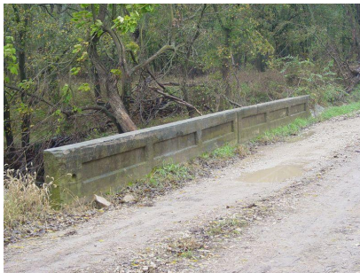
E. BR. Whitewater River Concrete Bridge. NW 130TH St. 10/20/2005.