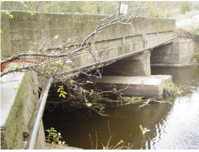
E. BR. Whitewater River Concrete Bridge. NW 130TH St. 10/20/2005.