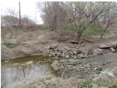
View of bridge rubble facing east. 03/13/2017. Wendi M. Bevitt