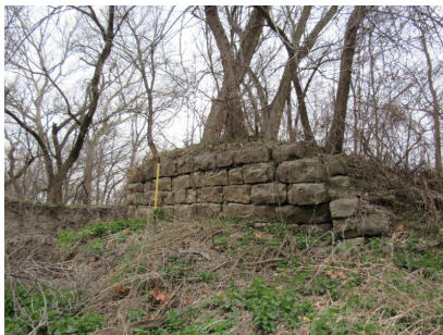
View of foundation of bridge on the west side of the Whitewater River. 03/13/2017. Wendi M. Bevitt