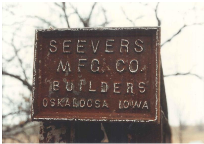
Deer Creek Beadstead Truss Bridge. Berwick, Nemaha County, Kansas. Plaque. 11/14/1989.