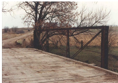
Deer Creek Beadstead Truss Bridge. Berwick, Nemaha County, Kansas. North View. 11/14/1989.