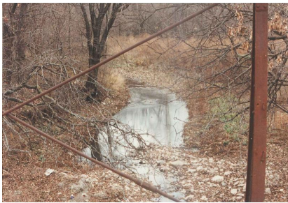
Deer Creek Beadstead Truss Bridge. Berwick, Nemaha County, Kansas. West View. 11/14/1989.