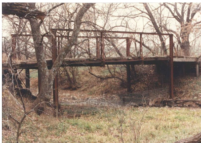
Deer Creek Beadstead Truss Bridge. Berwick, Nemaha County, Kansas. West View. 11/14/1989.