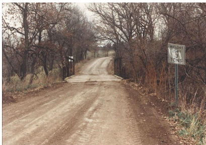
Deer Creek Beadstead Truss Bridge. Berwick, Nemaha County, Kansas. South View. 11/14/1989.