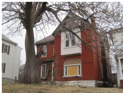
251 Orchard St. West Elevation.