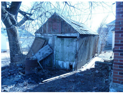
251 Orchard St. Garage. Myers. 02/19/2012