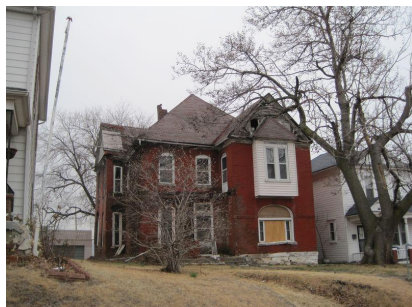
251 Orchard St. West Elevation.