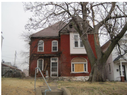
251 Orchard St. West Elevation.