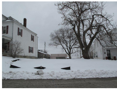
Splitlog House lot. 251 Orchard St. 03/01/2013.