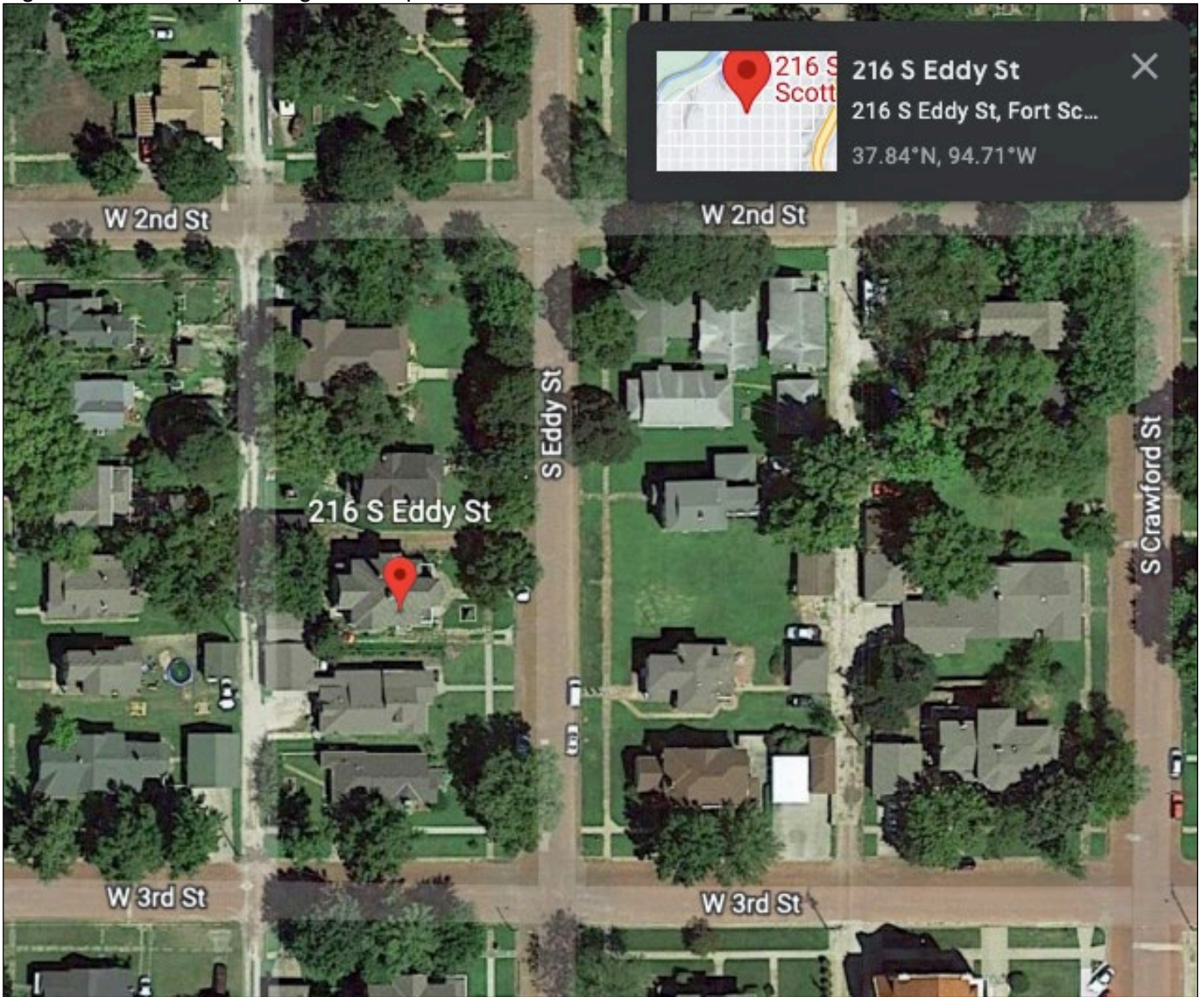
Figure 1. Location map. Bing.com map accessed 29 March 2022.