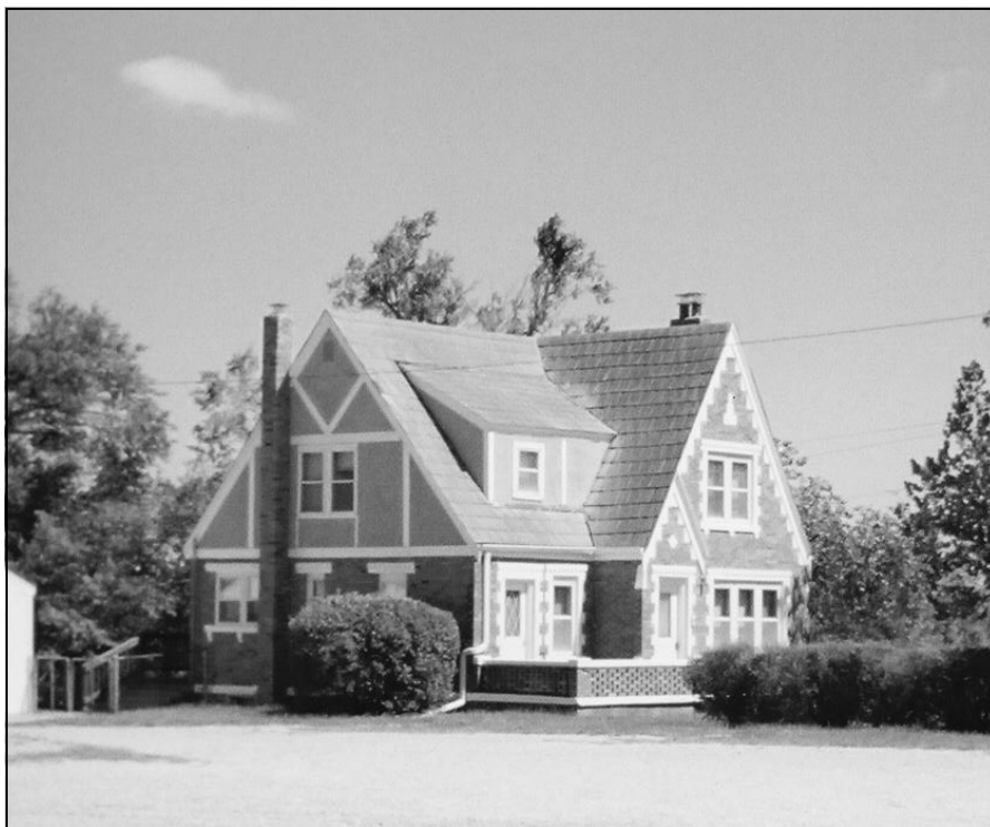
The Methodist Parsonage, still in good condition, stands east of the Church.