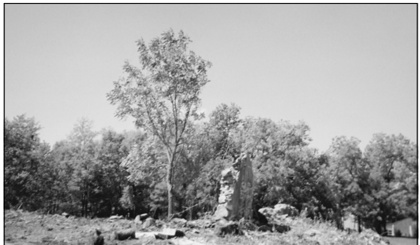
Members of the United Methodist Church cleared away brush and debris from the remnants of the 1856 limestone church, which stands directly across US 40 from the current Church.

This summer church members have cleared away the scrub and brush that covered the ruins, the remnants of the first U B Church, built of stone in 1856. A commemorative marker sits directly across U.S. Hwy 40 from where that first church was built. The current church and parsonage built in the 1930s during the Depression stand as a quiet tribute to the 150 years.