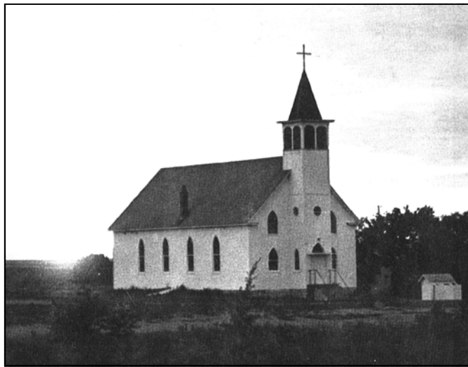
In 1984, St. Peter's Parish Church moved many valued items such as stained glass windows, statues and its cornerstone to the Territorial Capital Museum before it was taken down rather than left standing to face inevitable vandals.