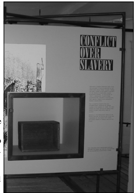
An original artifact, the candle box from the woodpile.

Lecompton. The heavy sills and the lighter members of the frame are cottonwood, as are the floors. The clapboards siding boards are black walnut. An outside staircase on the south side of the building carried people to the second floor. The present inside staircase was built around 1906 and the exterior one removed when the upstairs was remodeled as a lodge hall by the Odd Fellows.