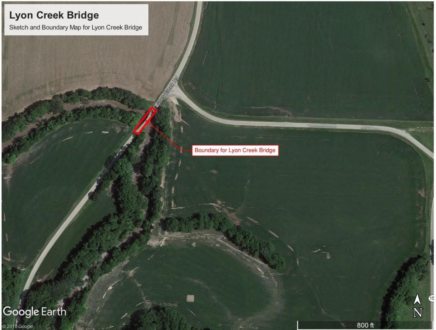
Figure 2 – Sketch and Boundary Map