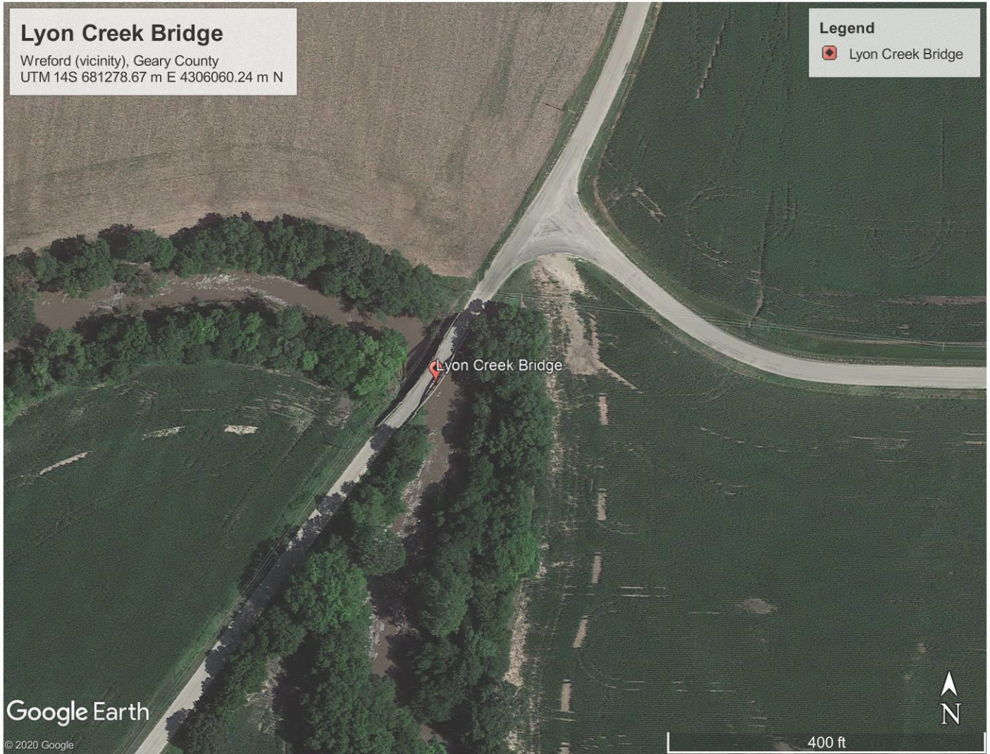
Figure 3: Location map, Geary County, Kansas