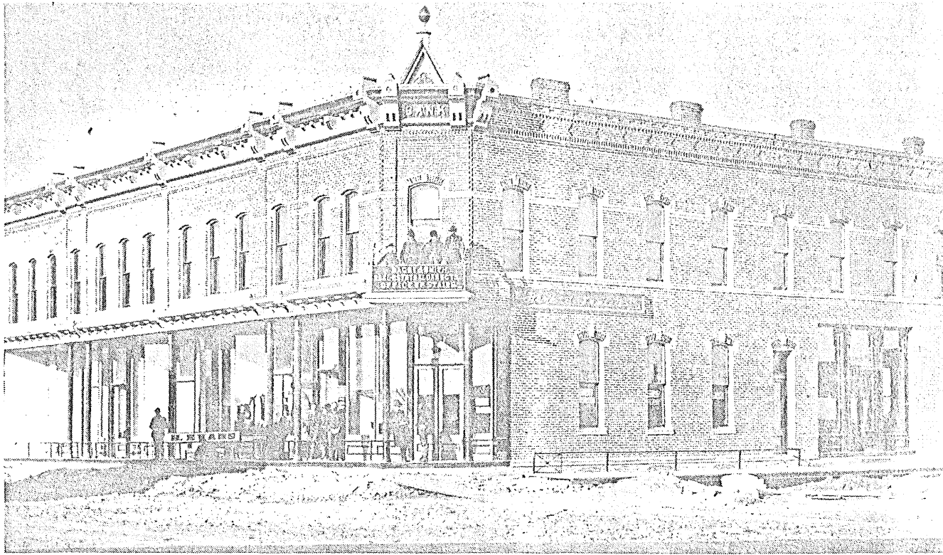
Mankato Investment Co. block is shown above.