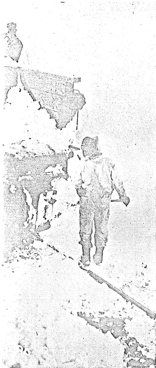
of Mankato's heaviest snow storms, which hit this area in 1920. The above picture was snapped one mile west of Mankato on the Mo. Pacific R.R.