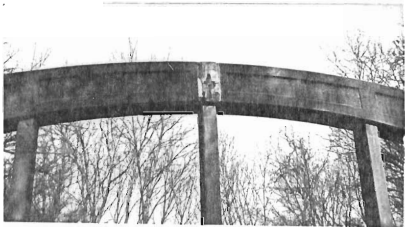
Pottawatomie Creek Bridge West arch indicating removal of thru strut.