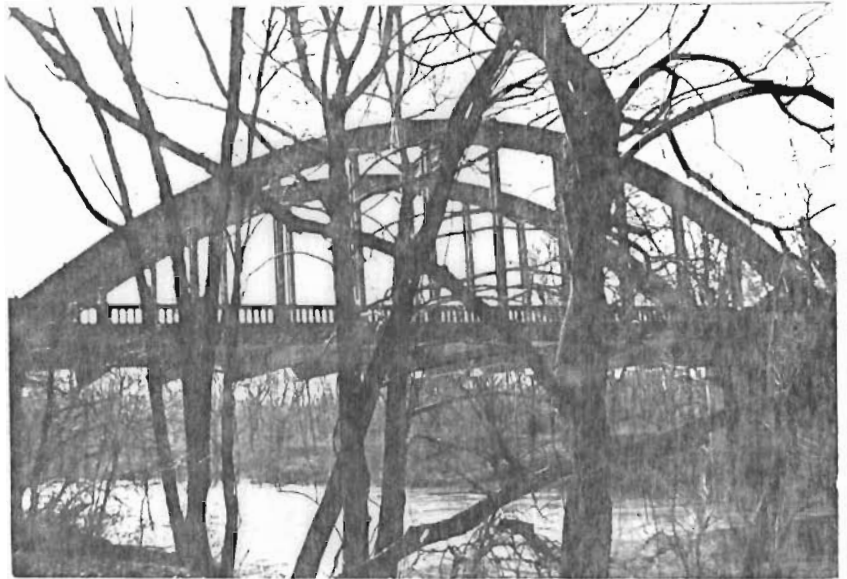
Pottawatomie Creek Bridge West side looking southeast.