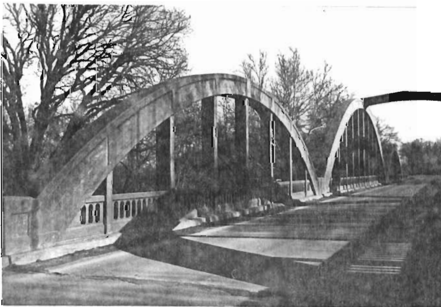
Pottawatomie Creek Bridge West arch looking northwest.