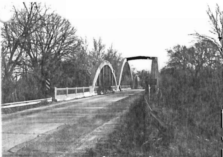
Pottawatomie Creek Bridge South approach looking north.