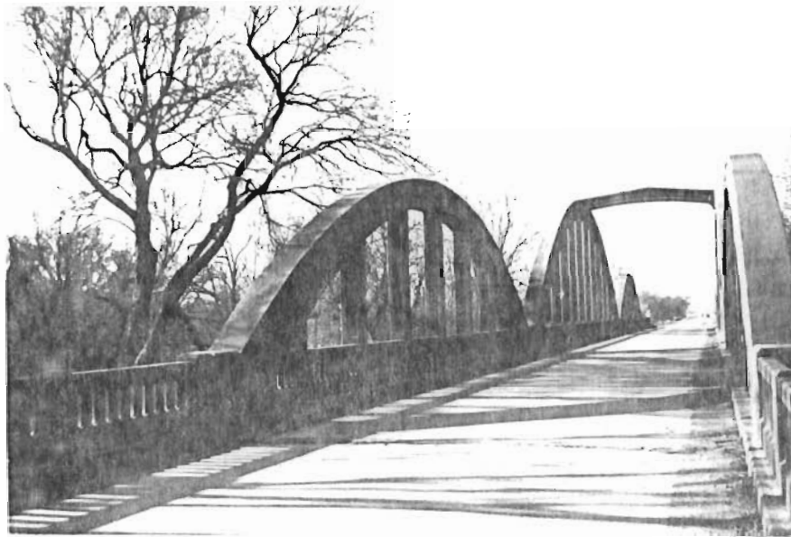
Pottawatomie Creek Bridge North approach looking south.