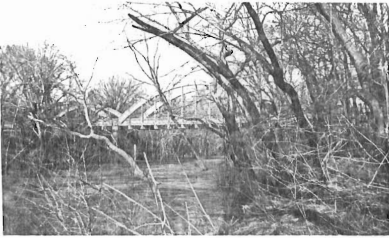
Pottawatomie Creek Bridge East side looking southwest.