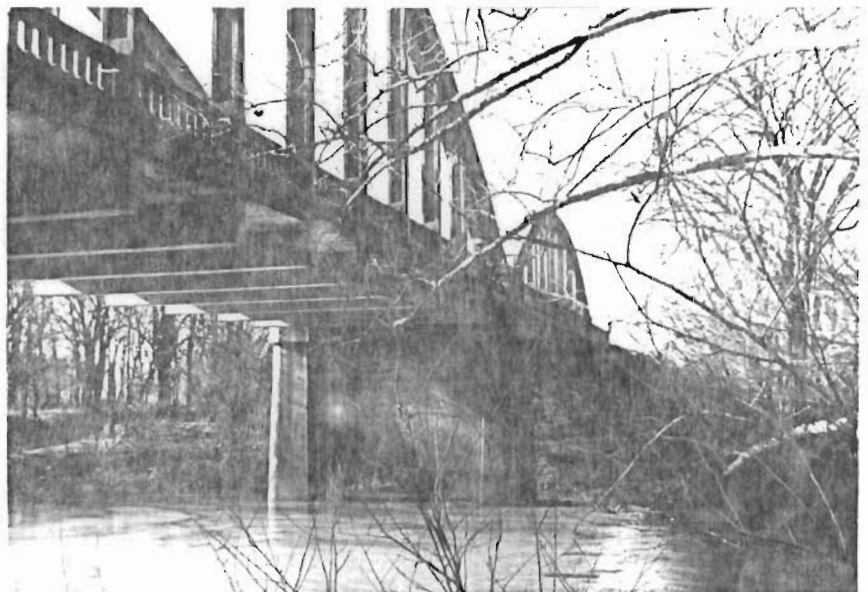
Pottawatomie Creek Bridge West side looking southeast.