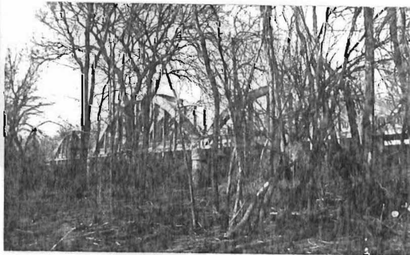
Pottawatomie Creek Bridge East side looking southwest.